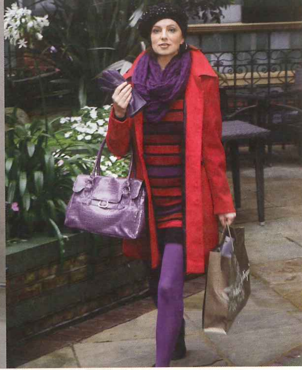
Left 1098306 Animal print top | £26 5702550 Asymmetric belt | £10 5223342 Large hoop earrings | £7 5221412 Mirror bead necklace | £10 5222591 Silver stretch bracelet | £10 Right 1096281 Scoop neck stripe tunic | £28 1311301 Military coat | £65 Snood 5403383 | £12 5802369 Fine rib tight | £6 5604486 Mock croc fold over bag | £22 5501601 Sequin beret | £10